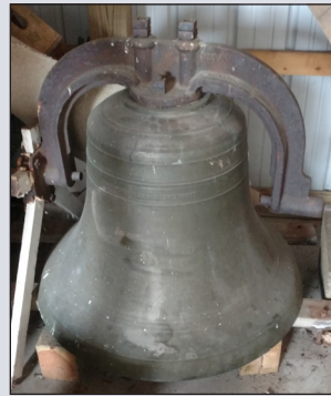
36" Bronze Bell

Old Rocker, Settee, Claw foot Occasional Table, Ginger Bread Clock, Dresser, Curved Glass China Cupboard, Lincoln Press Back Rocker, Wood Chairs, 2 Seven Foot Barn Cupolas, Horse Weather Vane, Cow Weather Vane, Hand Corn Planter, Clear Glass Pcs, Milk Glass Pcs, Colored Glass, Knick Knacks, Figurines, Jewel T Bowls, Pink Depression